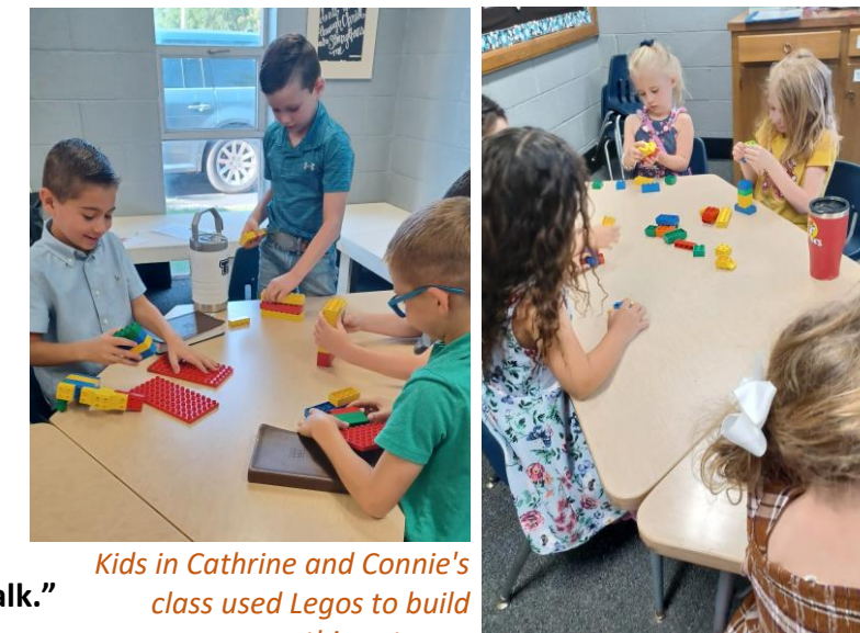
Kids in Cathrine and Connie's class used Legos to build something strong.