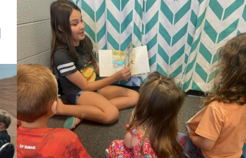
Kids of all ages have enjoyed studying God's 10 Commandments.