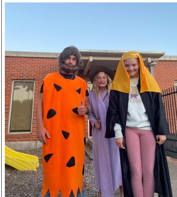
This is what Westgate Youth students do for fun at 6 a.m. after being up all night. We had a blast at the Lock-in last Friday!

Please pray for all our students as they begin a new school year!