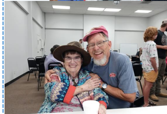
Family Fun Night shenanigans!