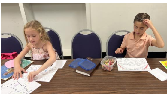
This new group of 2<sup>nd</sup> and 3<sup>rd</sup> graders worked on Promotion Sunday projects.

more opportunities, please consider taking a Wednesday to share a song that is meaningful to you. Sept. 27 and Oct. 25 are available. Please sign up on the clipboard in the hall.