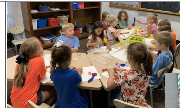
Children used blocks and playdough to work together. Relationships are built as we brainstorm, create, encourage, and clean up