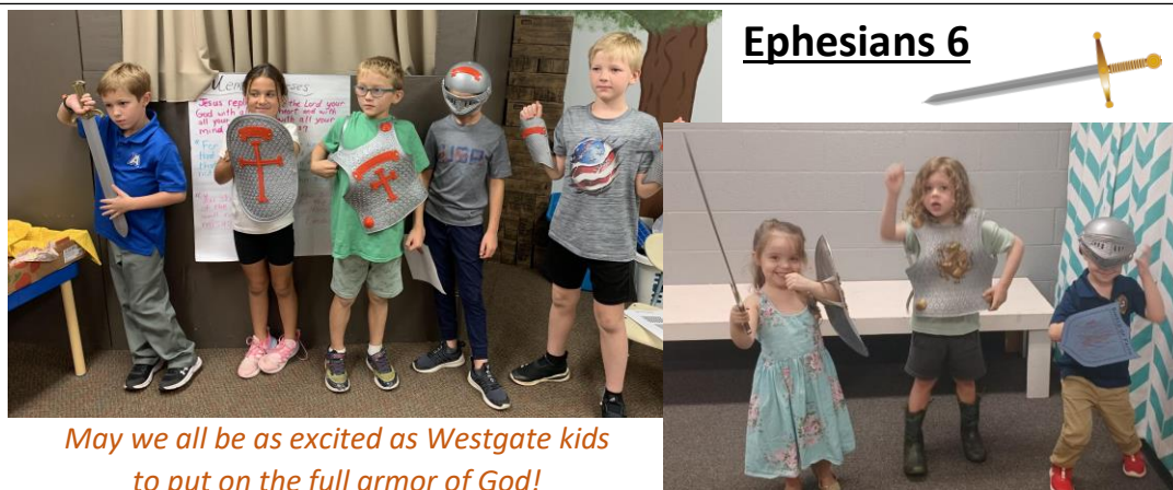
May we all be as excited as Westgate kids to put on the full armor of God!

The knee-jerk reaction might be to just stop protecting people since some are abusing it and using it to have power over others or shirk responsibility. However, this would be unfair to those who are being protected against such safeguards. In football quarterbacks will now be penalized for the fake slide, it’s called the “Kenny Pickett Rule,” named for the first player to abuse the slide rule. Perhaps this same mentality should be used elsewhere. The media should expose those abusing protective safeguards. Real victims of racism should cry out when people who are not victims claim they are, same with real victims of sexual abuse. Because these false cries out are making people not want to protect them at all and remove the safeguards. Similarly, when the Church protects people, when the church serves and gives, some will abuse it. But this does not mean we should stop helping and serving. Let’s not let those who abuse ruin it for those who are in legitimate need. May the Church be “as wise as serpents and innocent as doves” (Matthew 10: 16) in our dealings with people.