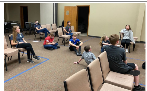
Playing games during the Super Bowl.

Please pray for our students' well-being as they start this semester!