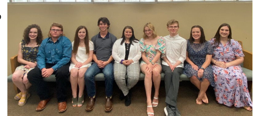
Youth Group Seniors