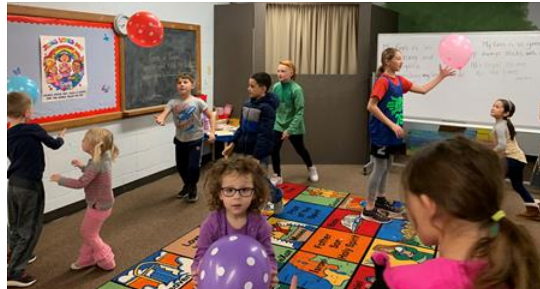
This Wednesday night group worked together as we discussed our compassionate and merciful God.