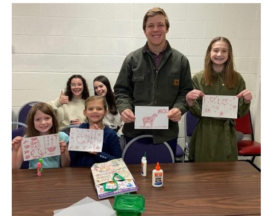
Westgate Youth Group helps out with crafts!

Please pray for our students as they begin a new school semester!