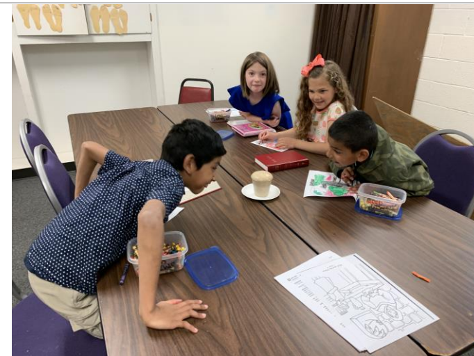
Second graders watched yeast overflow and they discussed God's generosity to Elijah.

On April 24 th , west hallway classrooms will be used for auction items for the Brisket Burn. 4 th and 5 th grade children will join the youth for class in the youth house. Some youth will assist with teaching younger children in Theo's room. West hallway teachers will have the day off.