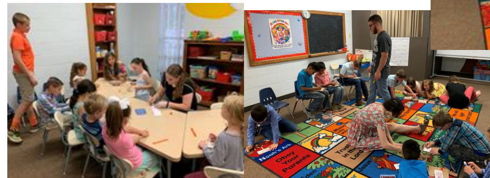
Many thanks to all the youth helpers who assisted in the combined class last week. Elijah and the chariot of fire was taught as we explored the mysteries and the promises of God.

In 2 Kings 6:8-23, God has been showing the prophet Elisha secret battle plans from the enemy country of Aram. The king of Aram is mad and sends a great army to surround Elisha and his servant. But Elisha can see another army all around them—God's army. God opens the eyes of Elisha's servant to see the army, too. God is everywhere, so we look for him around us.