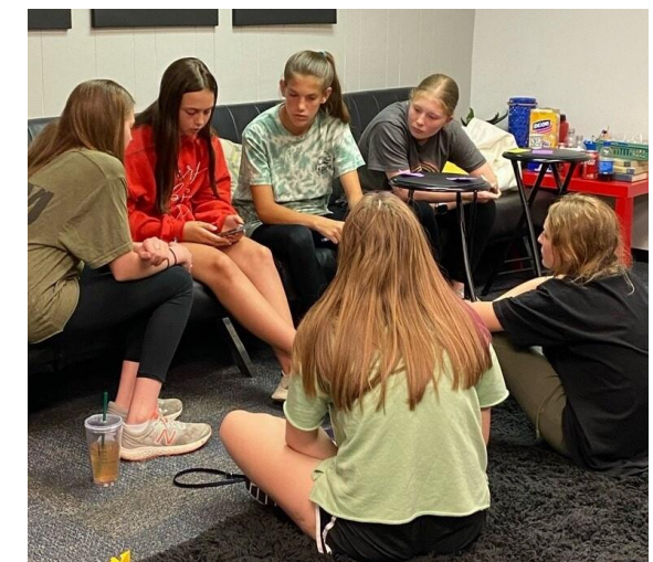
Youth Group girls studying the Bible during Wednesday night class

Please pray for our students as they work hard to finish this semester!