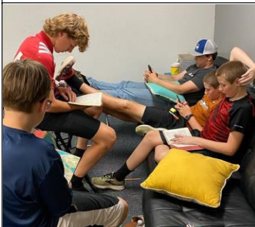
Youth Group boys reading from the Sermon on the Mount together.

Children heard that Elisha's men were fearful when they found they were surrounded by the Syrian army. Check out our fearful faces! Then God told Elisha, "Do not be afraid, for those who are with us are more than those who are with them."