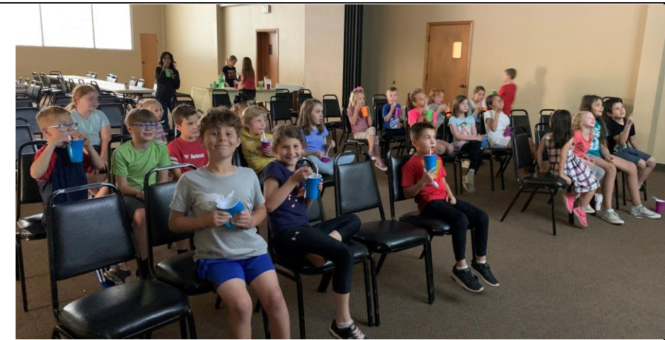
Wednesday PM students celebrated the end of school with root beer floats and a video on making wise choices.

Summary Verse for the next few weeks: “Worship the Lord with gladness. Come before Him, singing with joy.” (Psalm 100:2)