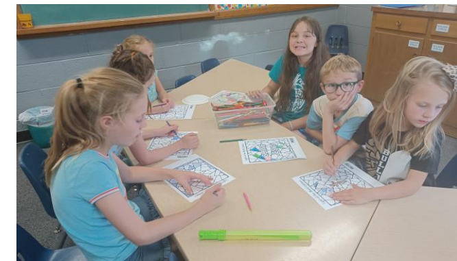
On Wednesday night, kids wrapped up Quarter 2 with Light-of-the-World-Catchers.