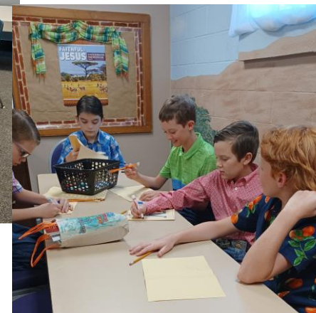
Last Sunday our kids kicked off into the 3 rd Quarter of Heart of God!