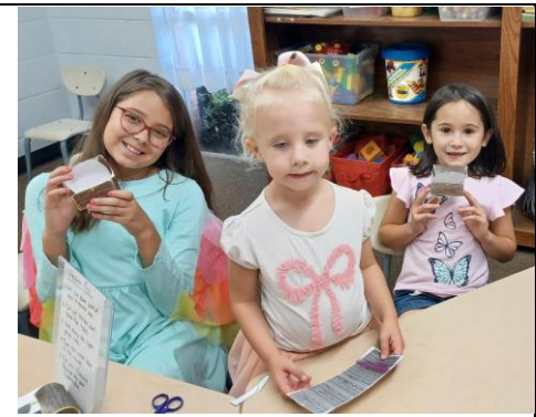
Kids in our Wednesday Night Bible Class made treasure boxes as a reminder that God is our treasure.