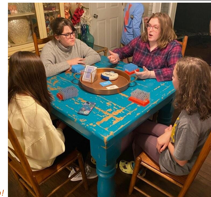
Youth Group girls playing a game together at our last devo!

Please pray for our students this school year!