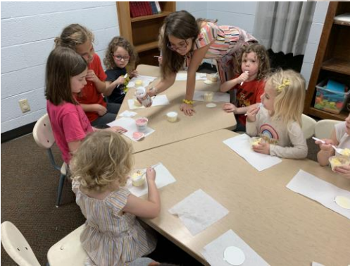
Children reviewed Paul’s shipwreck story. They brainstormed ways to encourage family and friends. We added sprinkles to ice-cream as we discussed ways to sprinkle our world with patience and kindness.