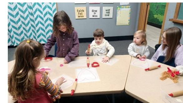
Children made play dough hearts while discussing God loves a cheerful giver.