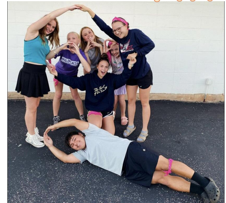
We had a great time competing at our game night last Sunday night!

Please continue to pray for our students this fall!