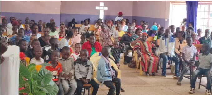
Rock Centre Church of Christ