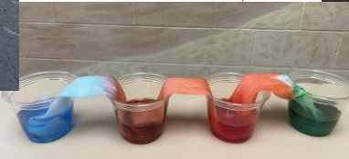
4 th and 5 th graders’ faith and science experiment