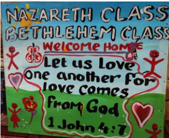
A sign the Sunday School made them