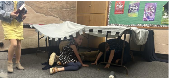
Bible Trails fun!

The $35 payment for the Fall Retreat is due today! You can pay online through eGive, write a check, or pay cash. The retreat will be Friday, November 22, through Sunday, November 24, at Solid Rock Camp in Eastland. We will leave from Westgate at 5:30 p.m. and be back on Sunday morning at 11:30 a.m.