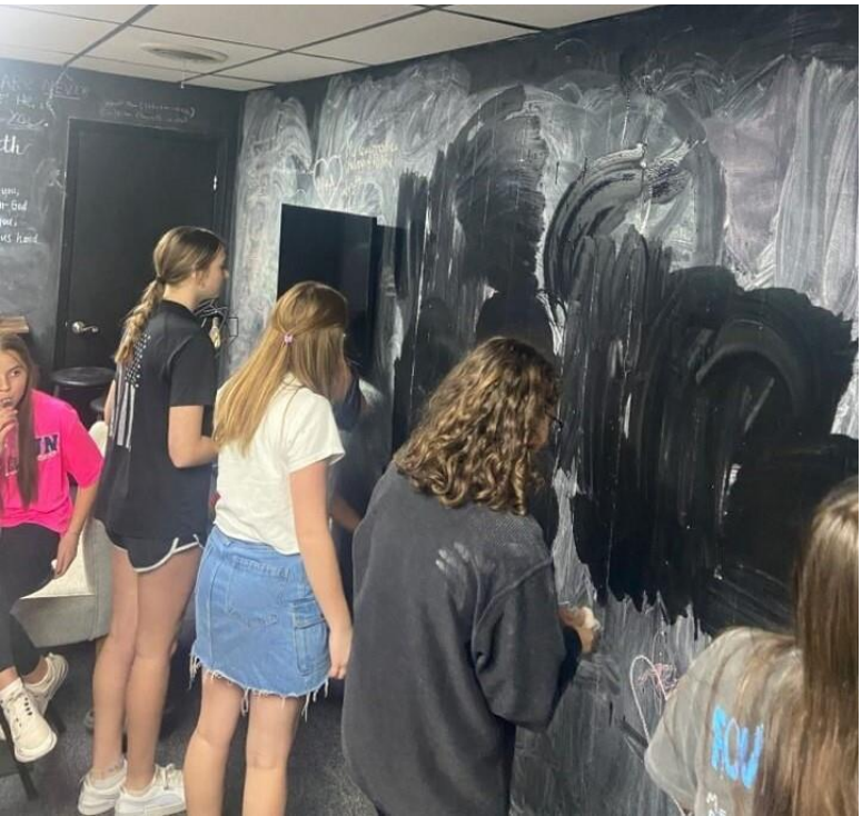
Youth Group students getting ready to play 4-team Pictionary at our game night last Sunday night!

Services at Westgate: Sundays—Bible Class 9:00 a.m., Worship 10:00 a.m., 5 p.m. Church office: (325)692-2300 westgatecofc@gmail.com Tuesdays—Ladies Bible Class 10 a.m. Wednesdays—Bible Class 6:45 p.m.