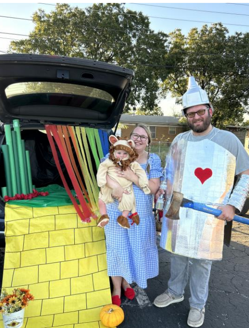
Trunk or Treat