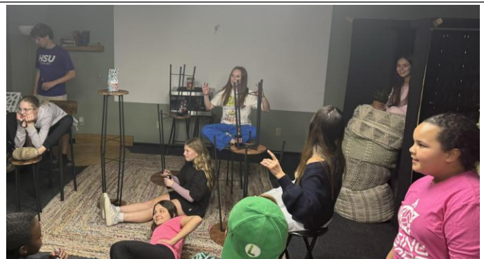
The teens did some rearranging in the youth house!

Please pray for all our students this semester!