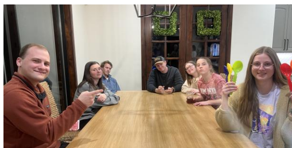
The 20-somethings' small group after a rousing game of spoons. Can you tell who won?