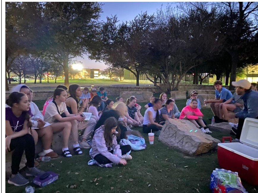
We had a great evening of food, fellowship, worship, and perfect weather at our Youth Group Devo at ACU last Sunday!

Please pray for all our students this semester!