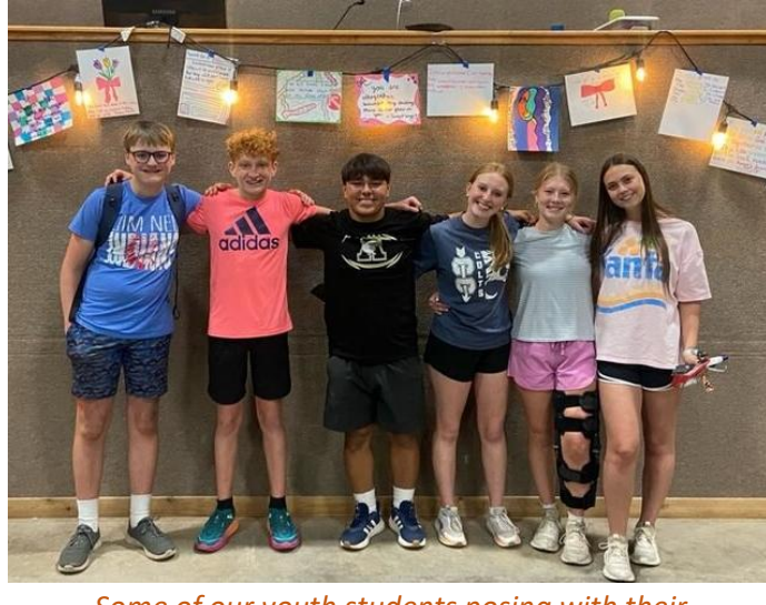
Some of our youth students posing with their drawings at the All-Church Retreat!

Please pray for all our students this semester!