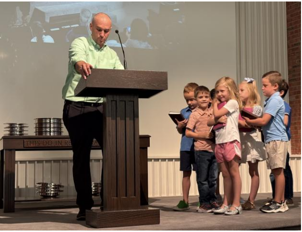
First grade Bibles