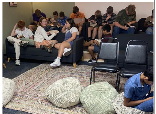
Students reading their Bibles in groups together during class last Sunday!

On September 28 , students are invited to join us for a Game Night at the Youth House! We will eat dinner together and have time to play some organized group games.