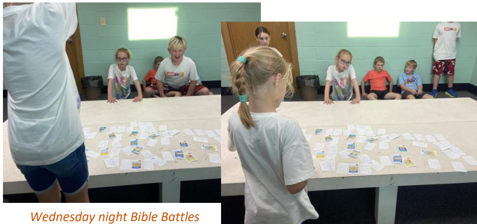
Wednesday night Bible Battles