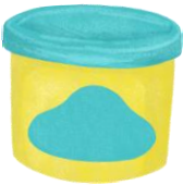
The youth group using Play-Doh to create something that describes themselves!