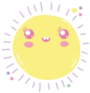
Good News fun!