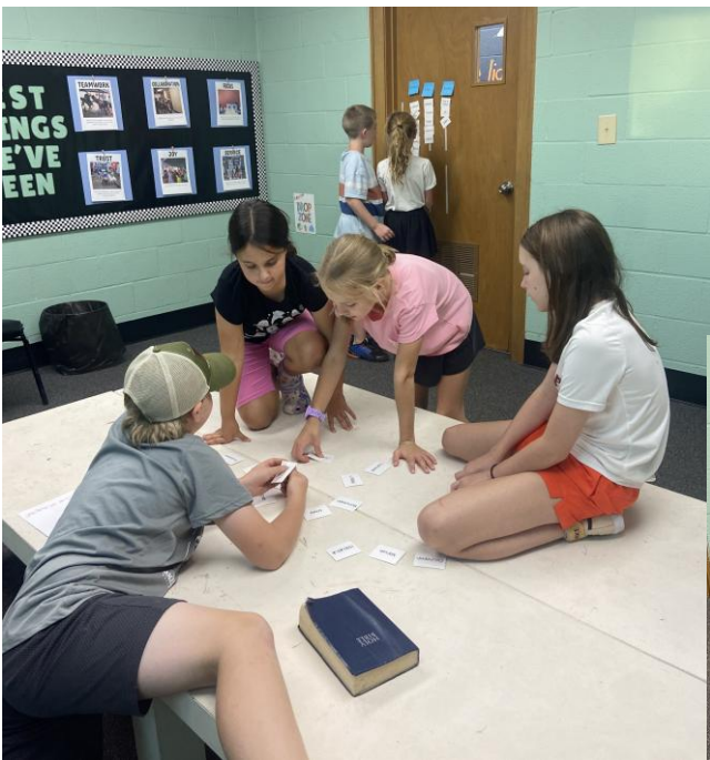
3rd-5th graders working hard on Wednesday nights!