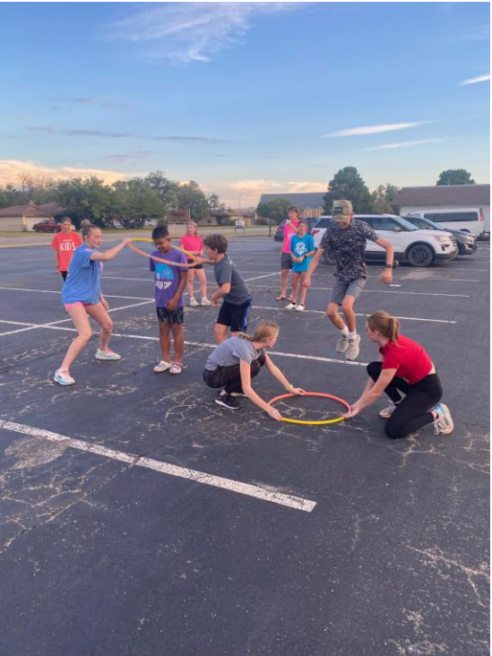
Youth Group students during a hula-hoop relay at our game night last Sunday!