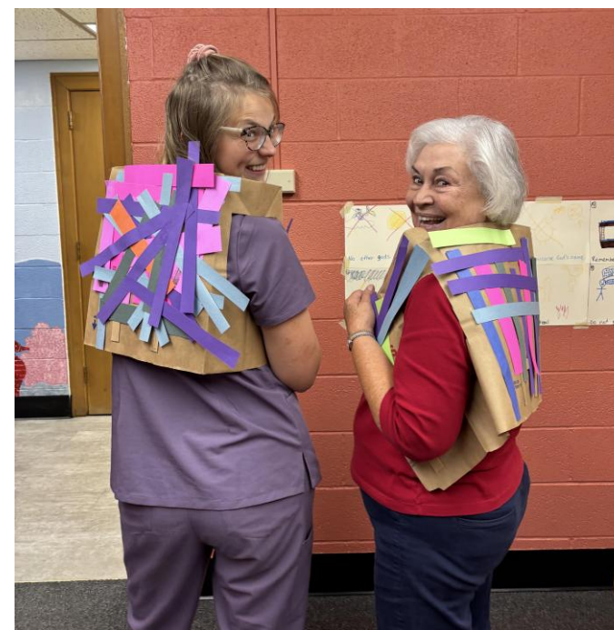
Wednesday night fun!