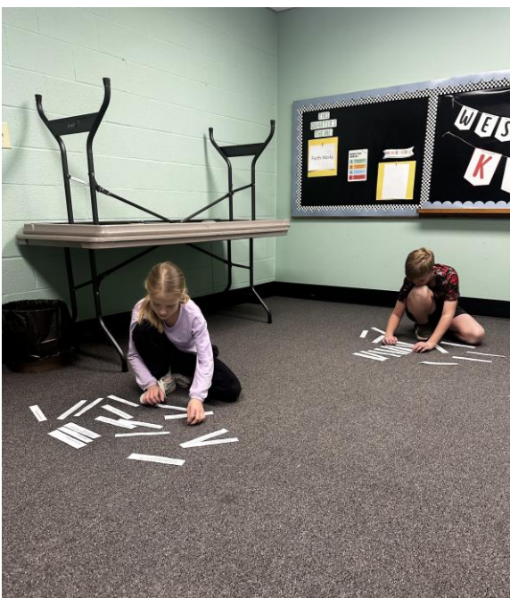
Pics from Wednesday night!