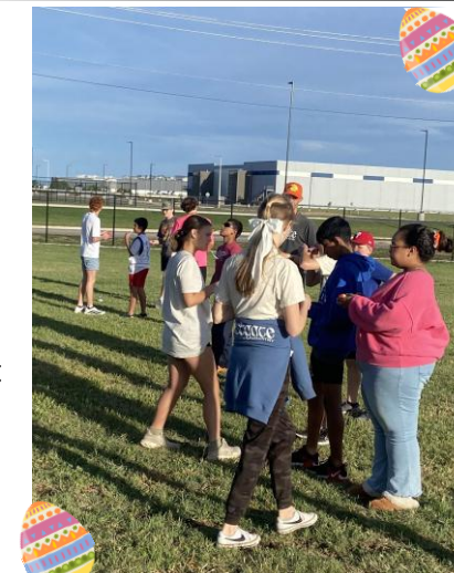
The Youth Group getting ready to play a game at the Easter EGGstravaganza last week. Thank you to all the youth group members who came and helped hide eggs!

Join us next Sunday, April 19 , in the youth house for a game night from 6 – 8 p.m.